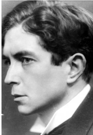
Herbert Howells (1892–1983)